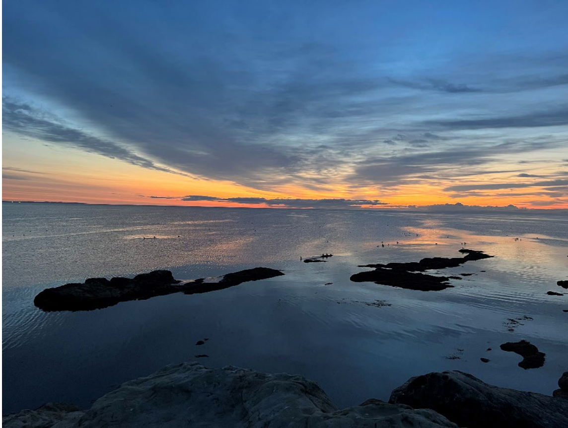
Photo of St. Andrews, Scotland